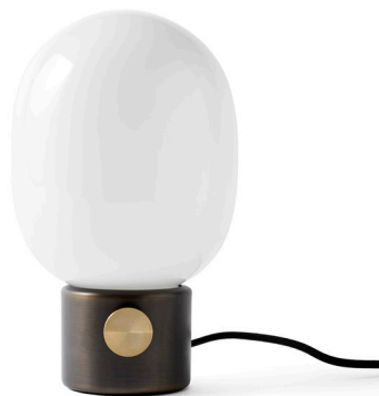
Bronzed Brass 1800859