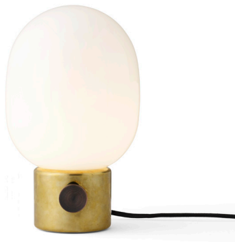
Mirror Polished Brass 1800839